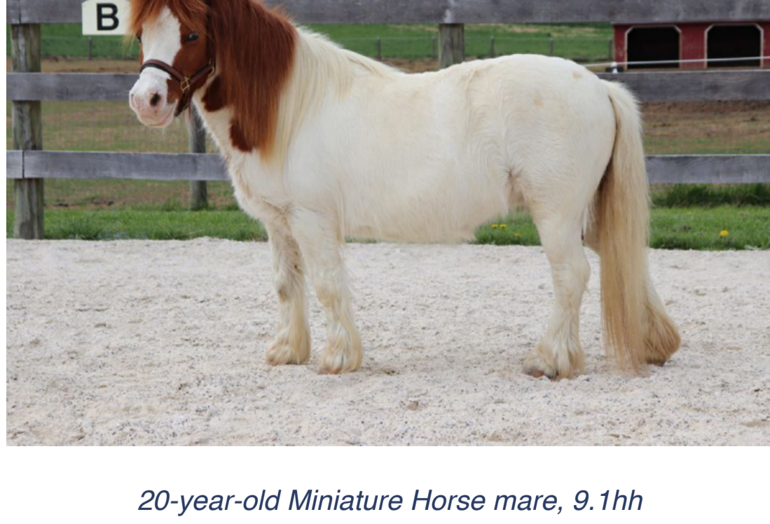
20-year-old Miniature Horse mare, 9.1hh

Cierra is cute and a mini and would make a great addition to any farm. She is best friends with other minis, Bundt Cake and Acorn, but also enjoys being outside with a large pony gelding. Cierra will require a dry lot as she arrived to DEFHR overweight. Cierra is kind and easy going. With her big blaze and one blue eye, you will fall in love at first sight.